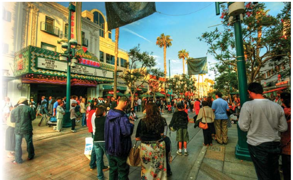
3rd Street Promenade Santa Monica, CA

By using place-based design solutions that address the physical aspects of the area, the City can encourage behavior that will make the French Quarter and Bourbon Street safer. Public spaces can - through poor design and care - foster antisocial, criminal, or other negative behaviors. Alternatively, public spaces can be reinvested in to encourage connectivity, positive interactions, and individual and communal responsibility. In order to create a place that business and property owners and the public respect, the French Quarter needs an improved image, sense of purpose, and orientation. By investing in street amenities such as benches, planters, seating areas, and trash cans - small investments that can make a big difference to the look and feel of a place - the City plans to enhance the quality of life and the security of the French Quarter.